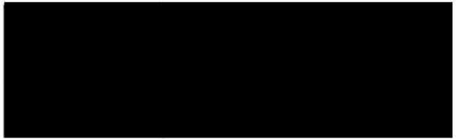
SENATOR SCOTT WIENER (SD-11)